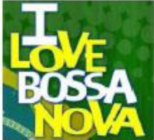
Samba / Bossa Nova