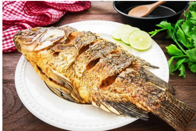
Fish & Seafood