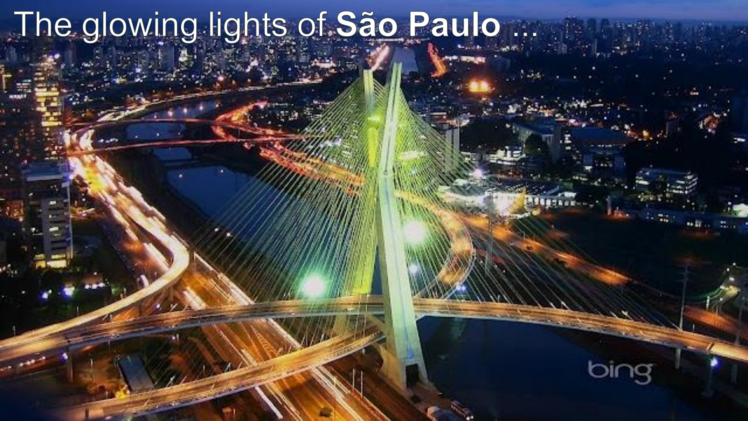
The glowing lights of São Paulo ...